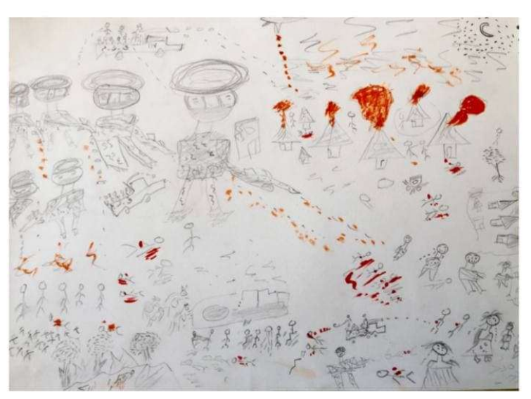
Figure 1. A picture drawn by the Sudanese refugee woman. She expressed her feelings by painting happy and peaceful memories in color, and sad and scary scenes in black and white.