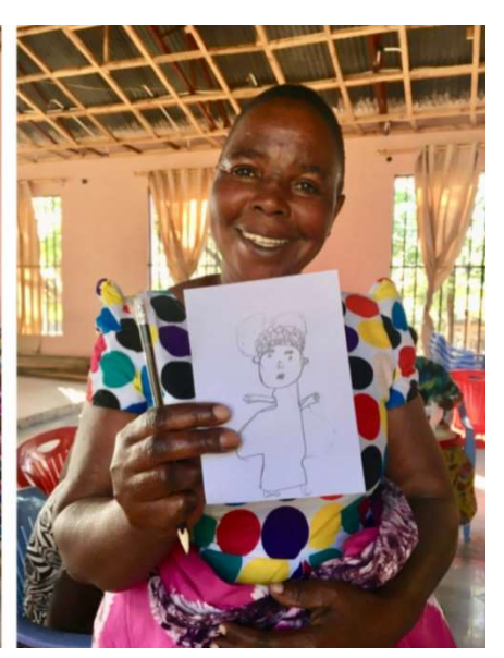
Figure 6. Some of attendees holding their portraits.

Here's what I learned about why these activities were meaningful: