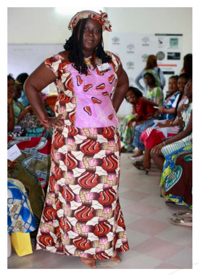
Figure 4. Fashion show for Benin ladies

Understanding Their Own Culture from a New Perspective