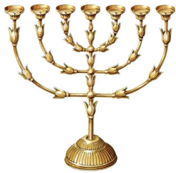
Figure 2. The lampstand, with the decoration of almond blossom

significant role he had. Those who saw the garments understood and remembered God's message through each of the elements of the clothing and their symbolic communication. Therefore, this passage gives clear evidence that the visual arts can be a communicative tool and medium that transfer and interpret specific messages.