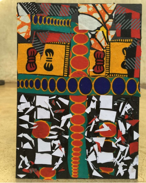
Figure 7. The mosaic and collage artworks designed and created by attendees. Left) This woman made a full-leaved, beautiful tree. She might imagine her life becoming like this tree.